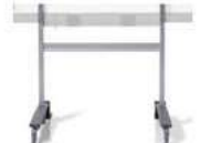
FS670 Floor Stand

322927 SMART Board SB-660 Interactive Electronic Whiteboard, 64" Diag, with Wall Mount