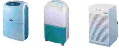
WDE20L/WDE30L WD-160M WD305

316455 KDK15WJA07 6" Window with axial turbo Ventilating Fan ..... US$85.50