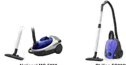
National MC-5030 Philips FC8386

* Super seal system-no more spills and splashes * Temperature indication-light to indicate availability for hot and chilled water * Stylish design-light grey color and modern shape that blend in with any location * Size: 31(W)x31(D)x64.5(H)cm ..... US$531.30