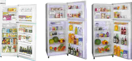
RT08V WRK13 WRK14