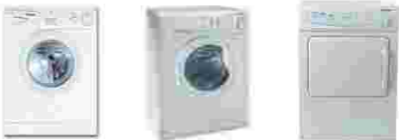
CN63 C2085 CV116

* Capacity : 285 Litres * Non-CFC * Dimensions (HxWxD): 1727 x 667 x 650mm ..... US$588.30