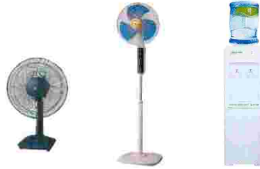
V40AH V40VH Watson's A003461

* Same as above specification but 48" ..... US$360.00