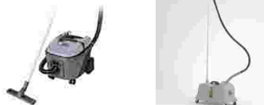
UZ 934 J-4000

316350 Spare Rubber Strip Set for .....20.60