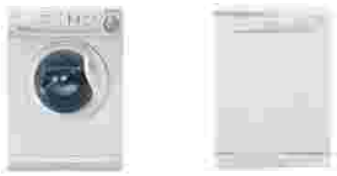
Alise CLD 135 CDF625

* Dry Load: 6 Kgs * Energy consumption : 3.96kW/cycle wash * Dimensions unpacked (HxWxD): 85x60x60cms * Weight unpacked : 31Kgs ..... US$461.00